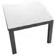
End Table - Square