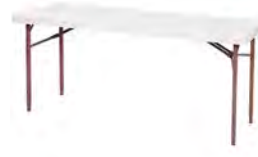
Unskirted Table - 30" High 4ft., 6ft., 8ft.