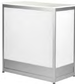
Storage Counter - 40"