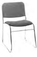
Grey Fabric Side Chair