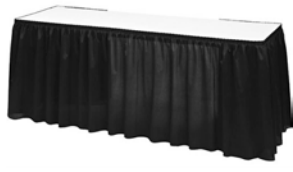
Skirted Table - 30" High 4ft., 6ft., 8ft.