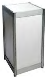
36" High Pedestal