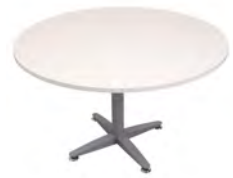
Starbase Table - 30" h