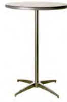
Starbase Table - 40" h (cocktail table)