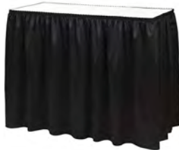
Skirted Counter - 42" High 4ft., 6ft.