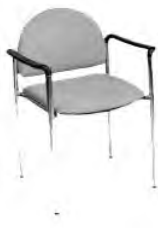
Grey Fabric Arm Chair