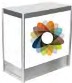
Storage Counter with Front Panel Graphic - 40"