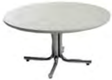
Starbase Table - 18" h (coffee table)