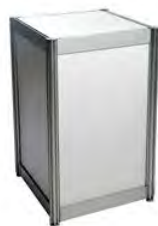
28" High Pedestal