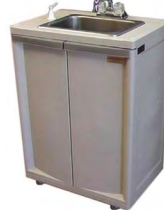
Mobile Hand Washing Sink